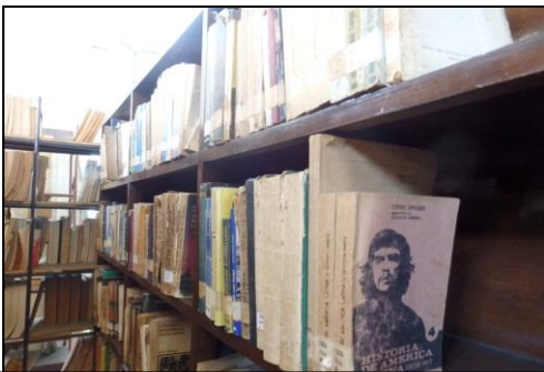
Shelf of books at the Cienfuegos City Library