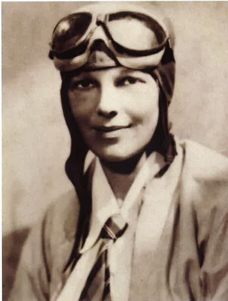
Harrison's Amelia Earhart

HARRISON, N.Y. -- Aviation pioneer Amelia Earhart was once a resident of Harrison.