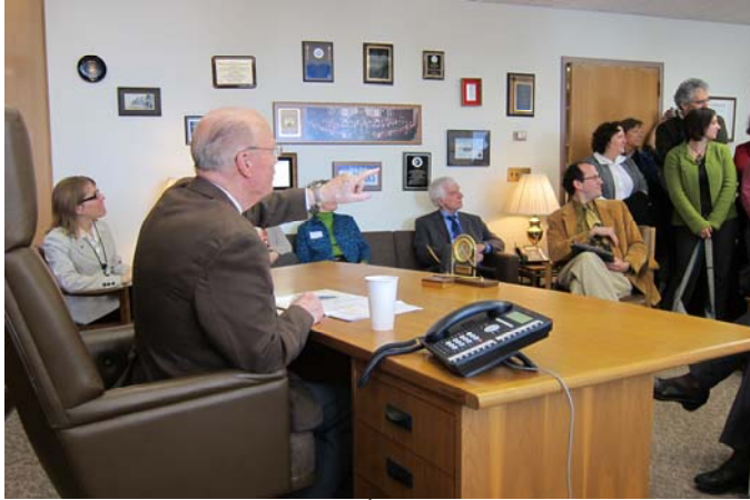
Pictured Senator Hugh Farley, 44 th Senate District & Chair of the Senate Committee on Libraries