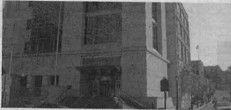
The Riverfront Library in downtown Yonkers.

A nonprofit has been launched to help support the Yonkers Public Library. Called the Foundation for the Yonkers Public Library (FYPL), its mission is to further enhance the library's ability to provide outstanding programming, cutting-edge technology and vibrant meeting places that best serve Yonkers' diverse community. That goal will be achieved through fundraising, advocacy and community partnerships.