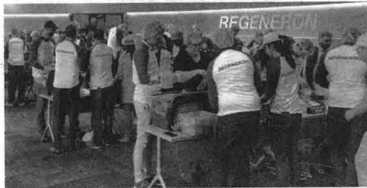
Regeneron volunteers in Tarrytown packaging meals for Rise Against Hunger.