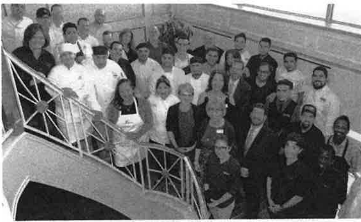
More than 30 culinary and beverage professionals participated in the event.