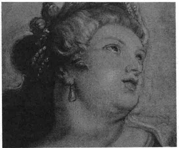
A portion of the Rubens painting "Reconciliation of the Queen and her Son" showing the head of Marie de Medici. The painting is on display at Iona's Chapman Gallery.