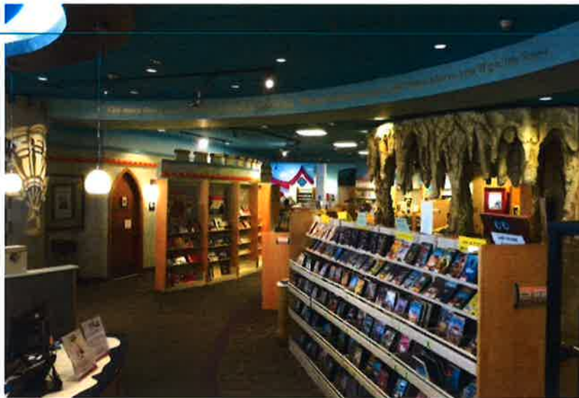
The Trove at the White Plains Public Library is one example of the inviting rooms tailored to young visitors.