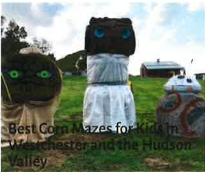
Best Corn Mazes for Kids in Westchester and the Hudson Valley