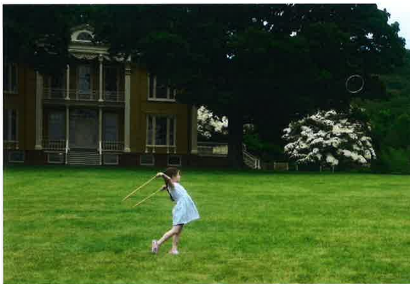
The Boscobel House and Garden is just one of many venues that can be accessed for FREE by borrowing a pass from participating libraries.

Looking for more helpful insight that helps you stay in the know with all things kid-related? Sign up for our newsletters ( https://mommypoppins.us2.list-manage.com/subscribe?MERGEO=&u=bdct1aa2618e8751c4b2b6acf6&id=51ccfd15a8&submit=Sign+Up ) and follow us on Facebook ( https://www.facebook.com/MommyPoppinsWestchester/ ).