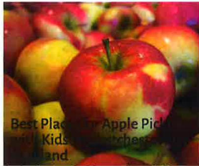
Best Places for Apple Picking with Kids in Westchester and the Hudson Valley