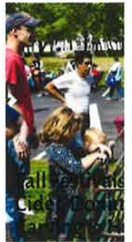
all the ways to enjoy the fall with kids in Westchester and the Hudson Valley

(/kids%2Fbest-corn-mazes-for-kids-in-westchester-and-the-hudson-valley) (/kids%2Fbest-places-for-apple-picking-with-kids-in-westchester-and-the-hudson-valley) (/kids%2Fall-the-ways-to-enjoy-the-fall-with-kids-in-westchester-and-the-hudson-valley)